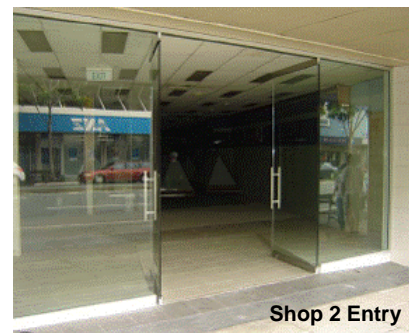
Shop 2 Entry