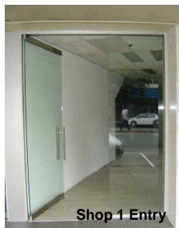
Shop 1 Entry

This commanding property is situated in the main street of Nambour between 2 major national retail outlets - Target and Best & Less. Significant upgrades have modernised this property and provide an up market street appeal for a very reasonable price.